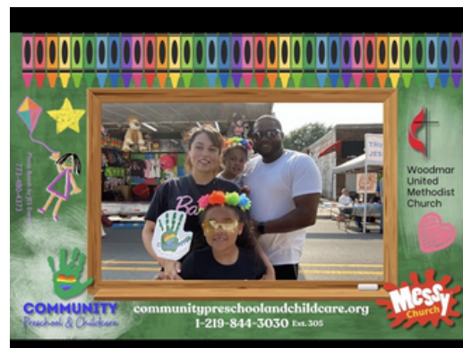
This is a photo from our booth at Live in the Ville.